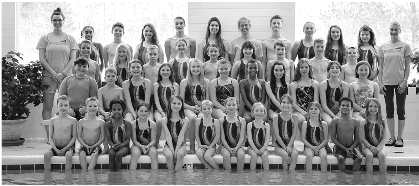
On Sunday, February 24, Charlevoix Stingrays competed at the Michigan Team Swim League (MTSL) State Championships at SVSU, finishing 6th out of 21 teams.

notable improvement by dropping 1.5 seconds in the 25 Backstroke to move up 16 places.