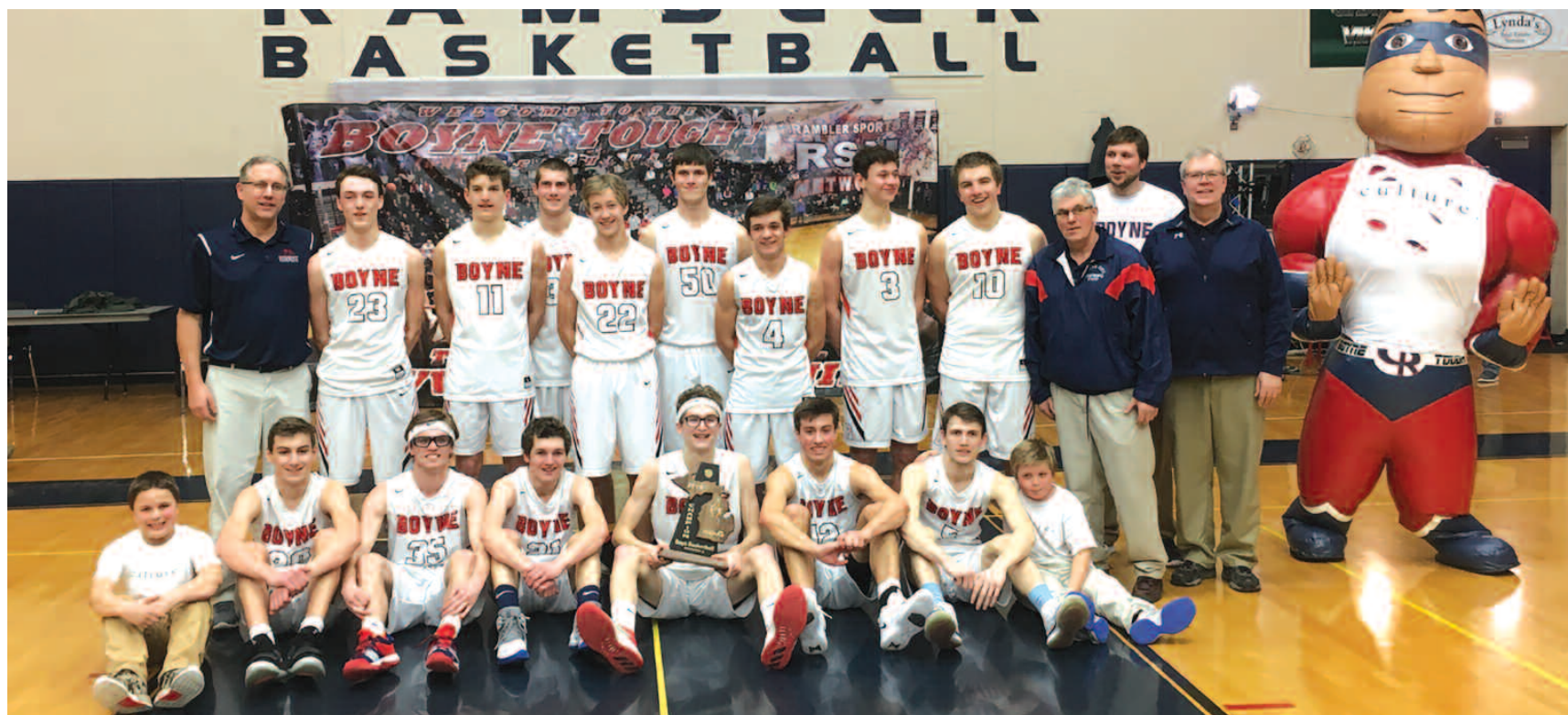
The Boyne City Ramblers boys basketball team and coaches pose with their Division 2 district trophy.